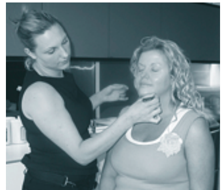
Hair and makeup were all part of the Glam Day